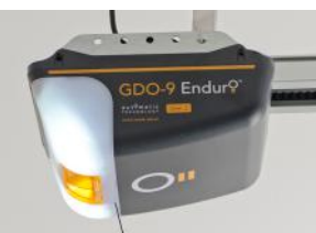
Opener with LED Courtesy Lights