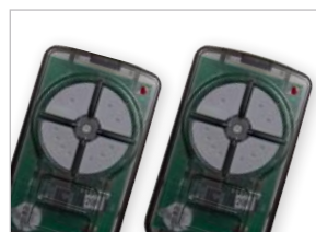
Two TrioCode™128 Remote Controls

*When maximum spring balanced weight is 20kg.