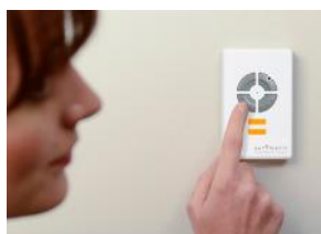
Wall mounted TrioCode™128 control panel