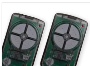
Two TrioCode™ 128 Remote Controls

*When maximum spring balanced weight is 20kg.