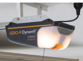
Opener with LED Courtesy Light